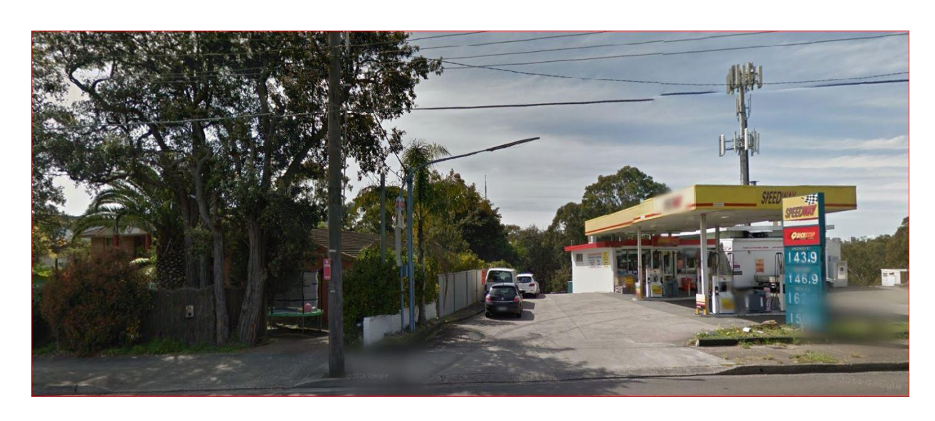
View of site looking east from Northwood Road